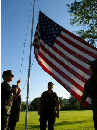
Putting up morning colors