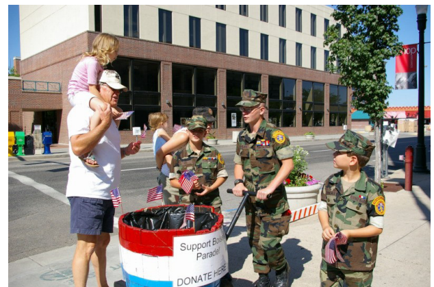
Passing out flags and soliciting donations as the Young Marines march pass the many spectators lining the downtown streets for the 4 th of July parade. You can't help but to admire these Young Marines and feel a sense of pride and admiration for their hard diligent work and self-sacrifices.