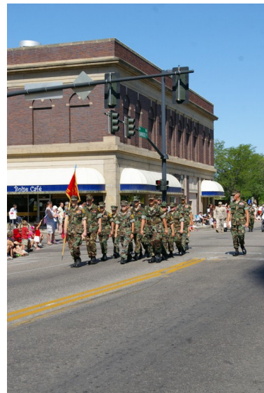
Treasure Valley Young Marines marching in downtown Boise 4 th of July Parade