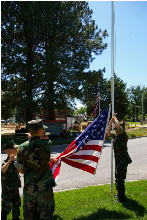
Closing of the ceremony and hauling down the colors. This has got to be the longest day these young Marines put in. From 3:30 am until closing, about 3:00pm... Semper Fi Young Marines. You did a fantastic job this day and made a lot of old timers, Army, Marines, Air Force & Navy smile with gratitude. →