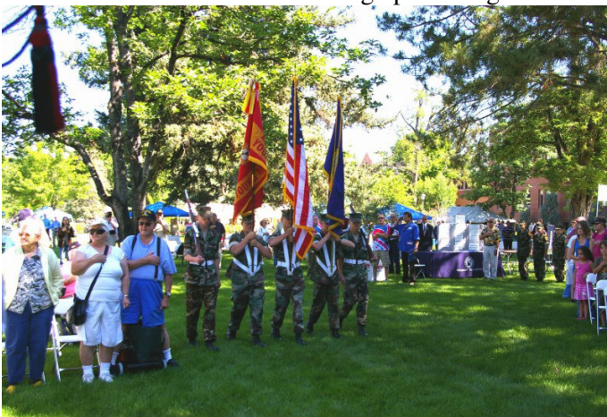
Opening ceremony by Treasure Valley Young Marine's Color Guard for the, "Welcome Home Veterans."