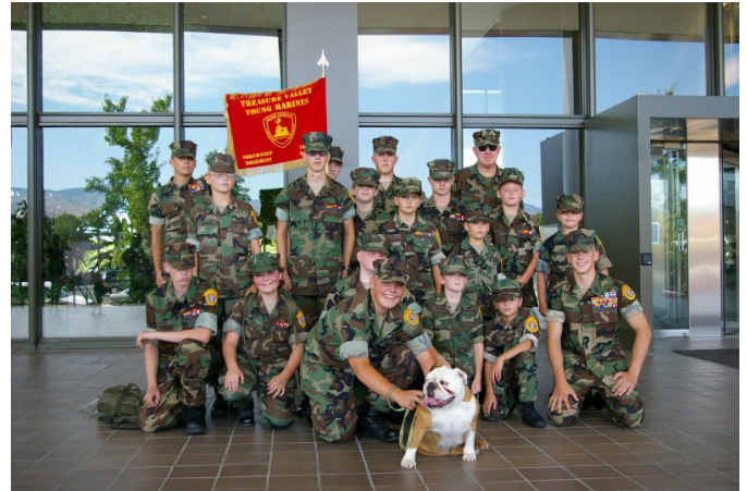
Getting ready for the July 4th, 2009 parade.